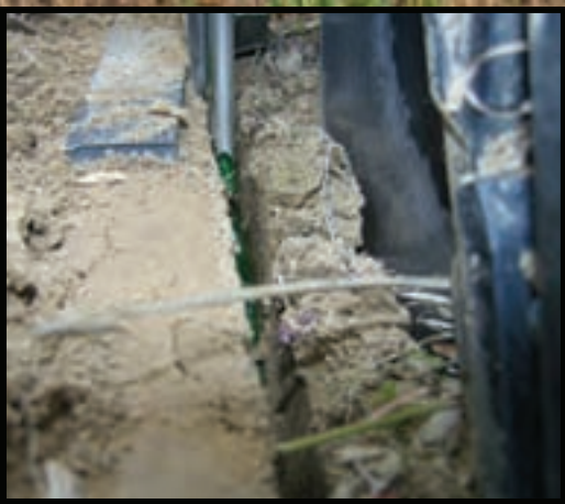
Image above shows the UMO-100 placing fertilizer in a band alongside the row for maximum uptake.